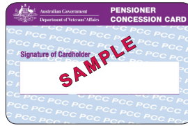
All states and territories