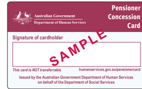
All states and territories