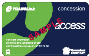
All states and territories

Must show a concession access card issued by TransLink.