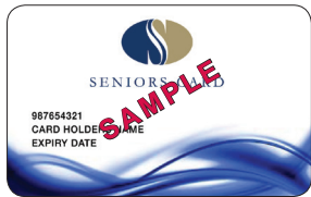
All states and territories