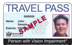
All states and territories