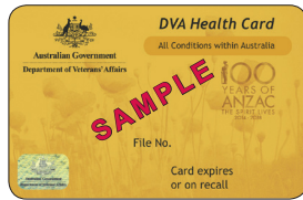
All states and territories